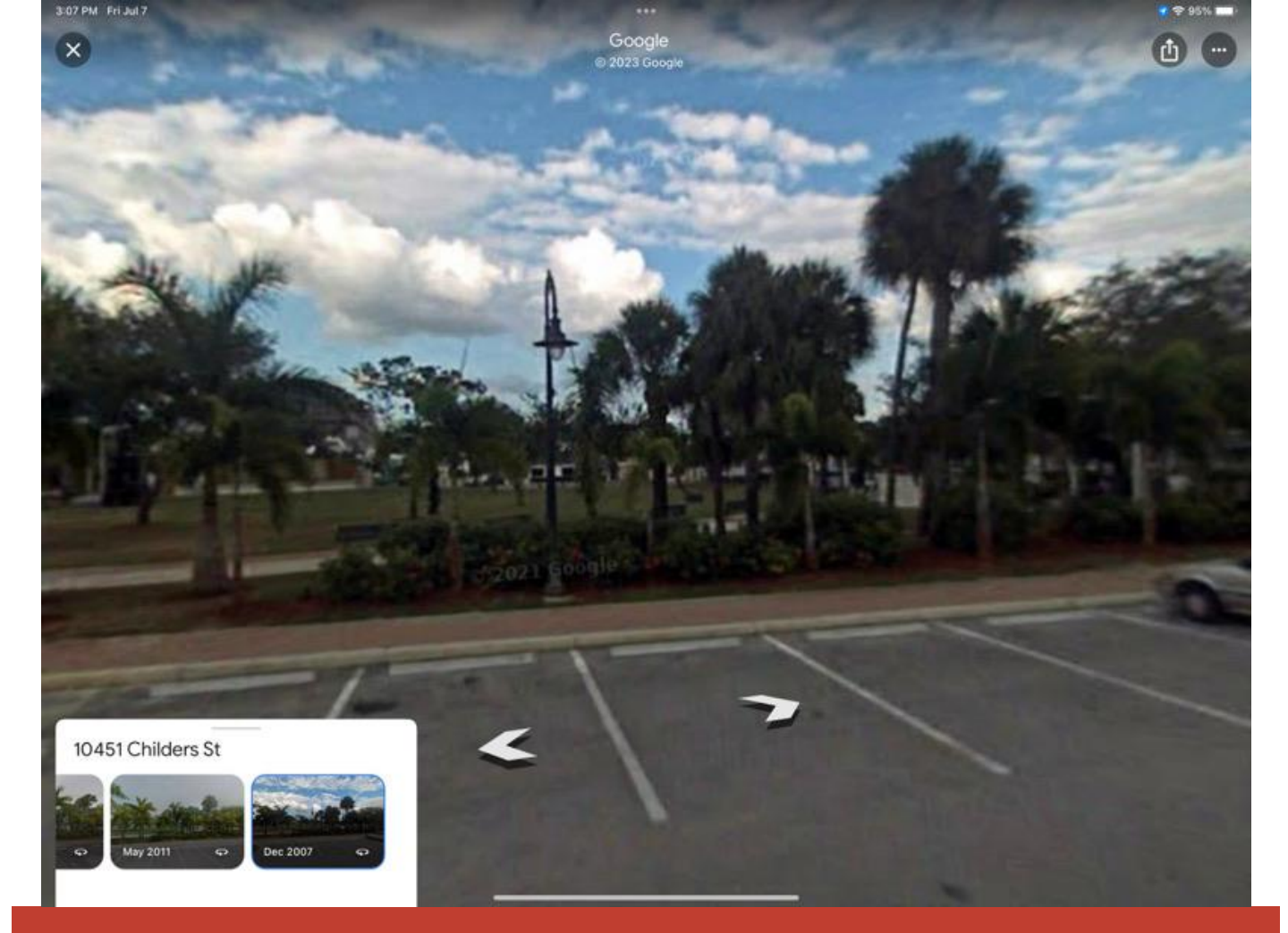
Riverside Park (2020)