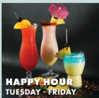
HAPPY HOUR TUESDAY - FRIDAY