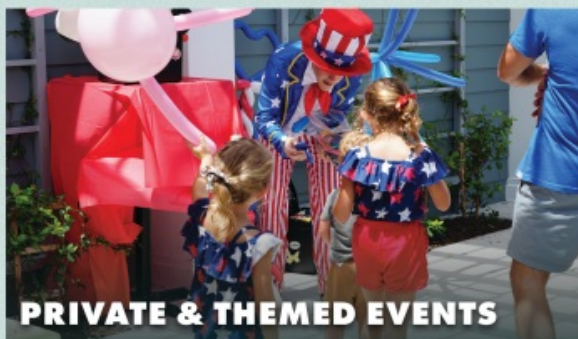
PRIVATE & THEMED EVENTS