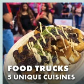
FOOD TRUCKS 5 UNIQUE CUISINES